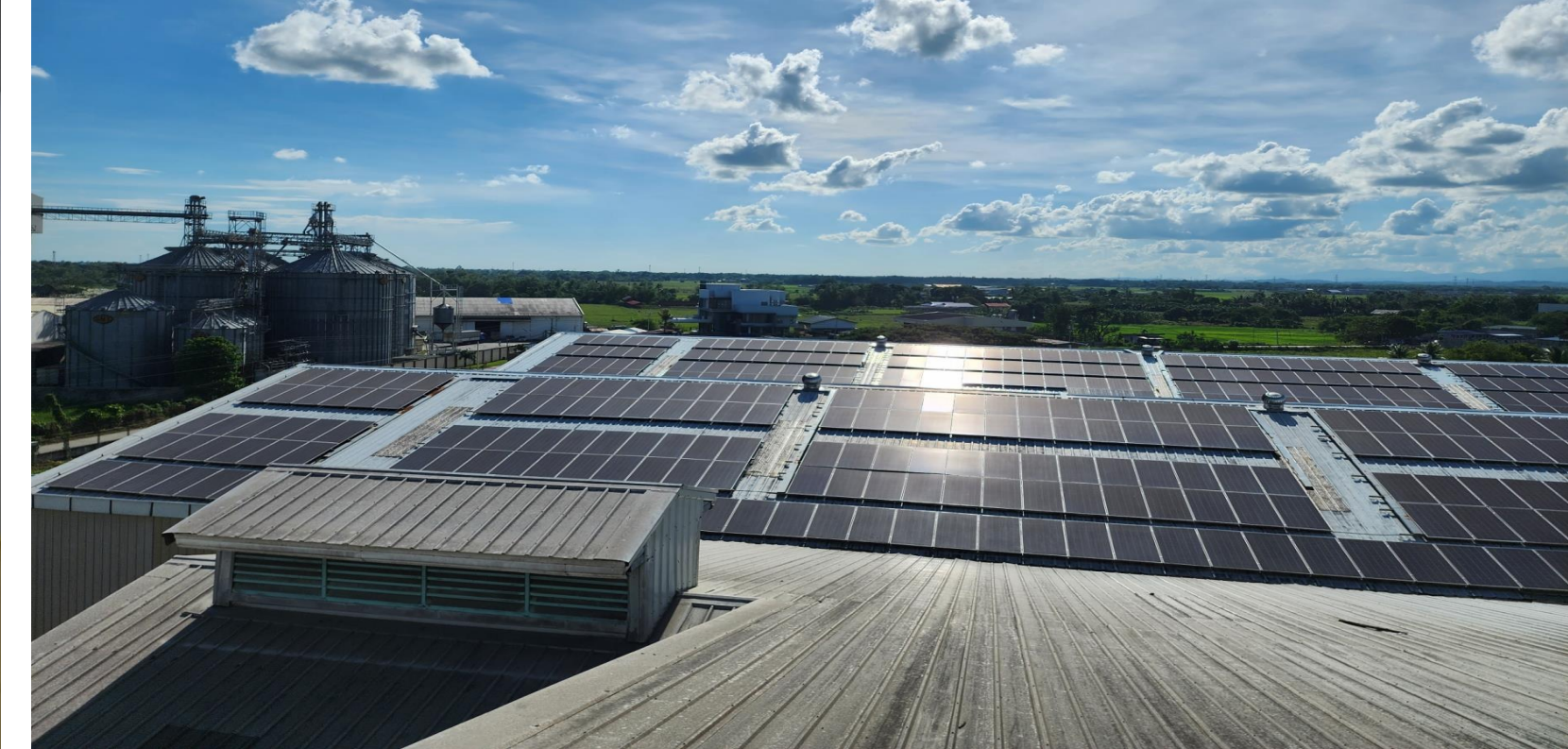
SOLAR ENERGY PROJECT commissioned in April within Iloilo feed mill

BLAST FREEZING AND COLD STORAGE facilities installed in Bulacan