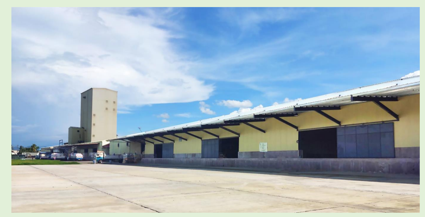
Our largest warehouse opened in December in Davao City