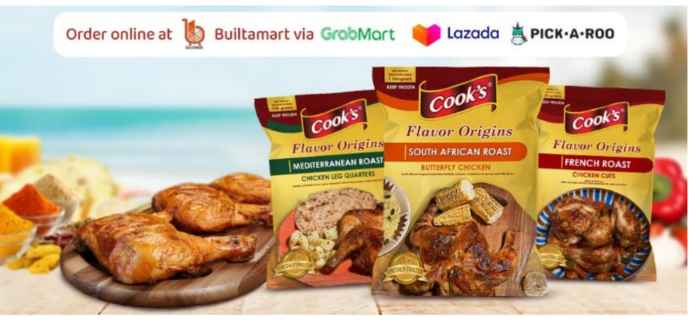
Cook's Flavor Origins launched in November